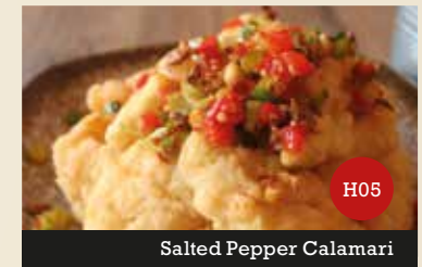
Salted Pepper Calamari