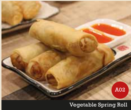
Vegetable Spring Roll