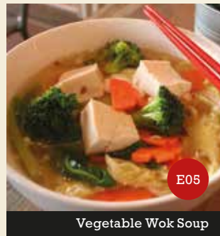
Vegetable Wok Soup