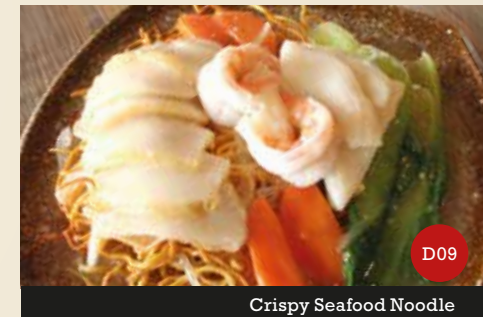
Crispy Seafood Noodle