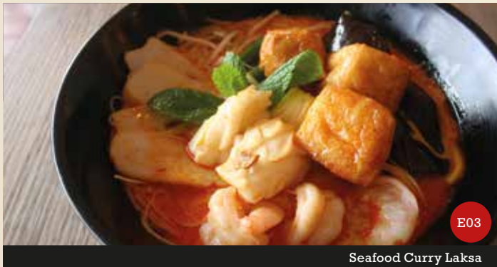
Seafood Curry Laksa