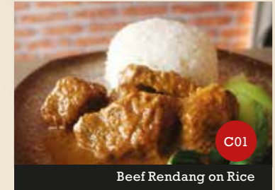
Beef Rendang on Rice

*C01-C17, Swap Steam Rice with Fried Rice (+Extra $3)