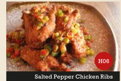
Salted Pepper Chicken Ribs