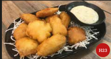
Garlic Mayo Rockling Fish Fillet