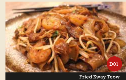
Fried Kway Teow