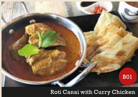
Roti Canai with Curry Chicken