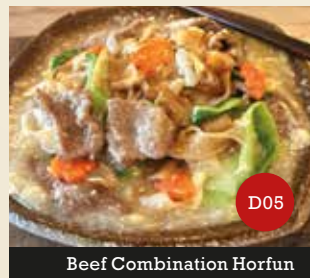
Beef Combination Horfun